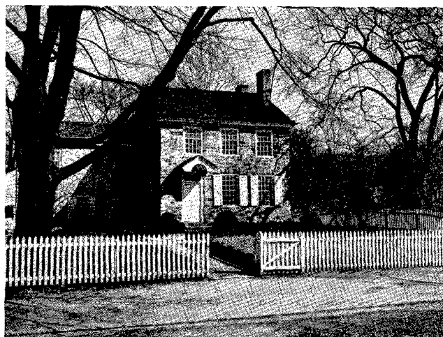
WASHINGTON'S HEADQUARTERS —This Valley Forge house will be visited by wives of members of the American Oil Chemists' Society during the fall meeting in Philadelphia, October 10-12.